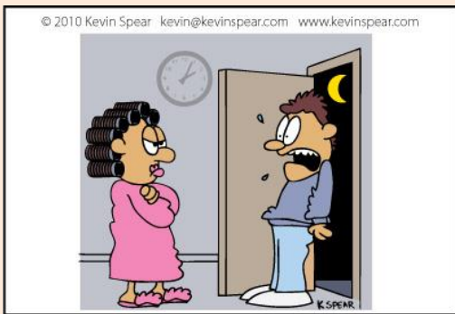
"Hi, Mom! Uh... Happy Mother's Day!"

*Remember: text messaging can also be used as way of communication with your student.