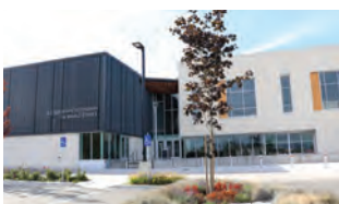
R.E. Mountain Secondary Grades: 9-12

Special Programs & Courses: Intensive Fine Arts, Dance, Baseball/Softball/Soccer and Hockey Academy.