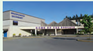
Brookwood Secondary Grades: 8-12

Special Programs & Courses: Hockey Academy.