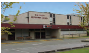
D.W. Poppy Secondary Grades: 8-12

Special Programs & Courses: French Immersion, Film & Television Production, Digital Immersion Program.