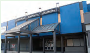
Aldergrove Secondary Grades: 9-12

所有学校都提供各类美术课程，包括音乐、戏剧和视觉艺术等。学校也提供特别课程和项目，包括大学先修课程等。欲知详情请访问 www.StudyInLangley.com