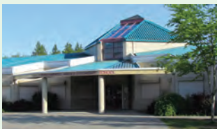
Langley Fundamental Middle & Secondary Grades: 8-12

Special Programs & Courses: Intensive Fine Arts Concentration (Creative Writing, Dance, Drama, Music, Photography, Visual Arts).