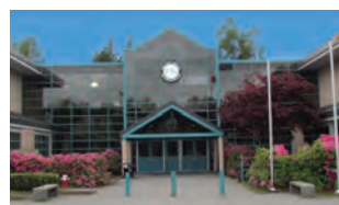
Walnut Grove Secondary Grades: 8-12

Special Programs & Courses: International Baccalaureate (IB) Program, Pre-IB, Mandarin Language.