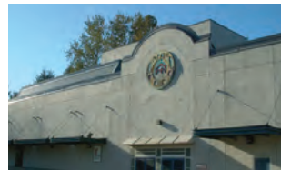
Langley Fine Arts Secondary Grades: 8-12

Special Programs & Courses: Musical Theatre, Rugby academy, 3D Games Design, Digital Media Development and Communication.