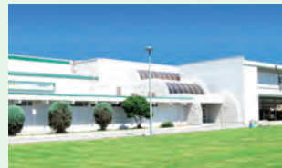
Langley Secondary Grades: 9-12

Special Programs & Courses: Honours Program, Information Technology, Business Education.